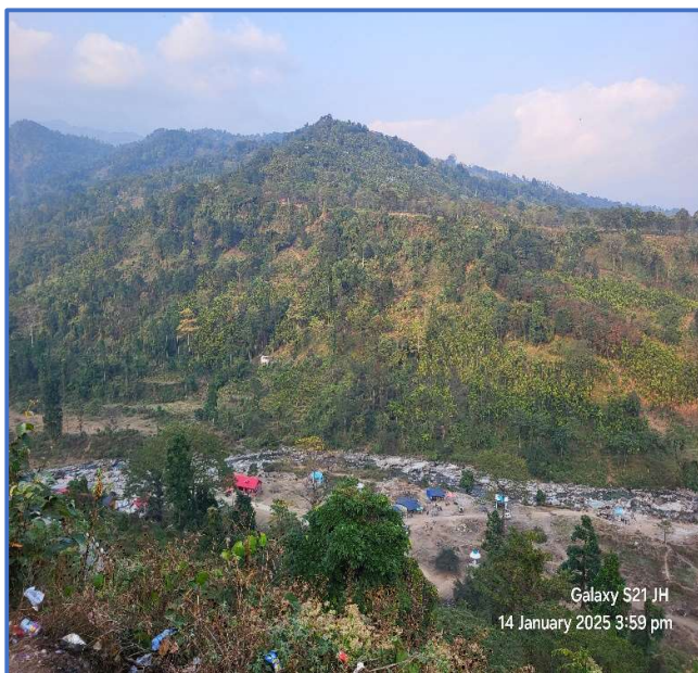
Samsing View Point