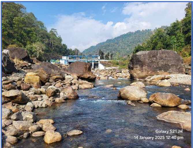
The Jaldhaka River at Bindu