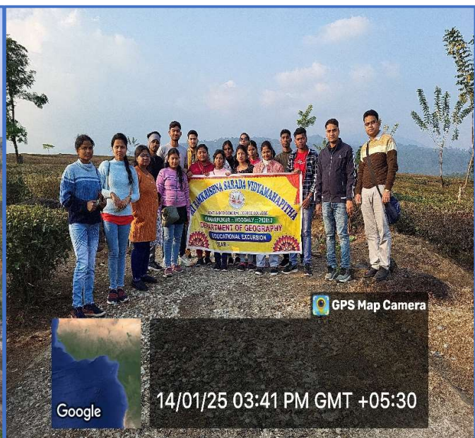
Samsing Tea Garden