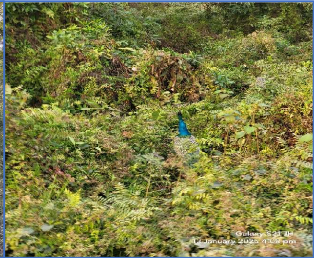
Jungle Safari at The Gorumara National Park