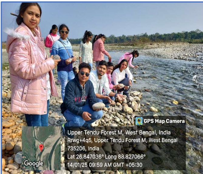
Rock Collection by Students at Murti River