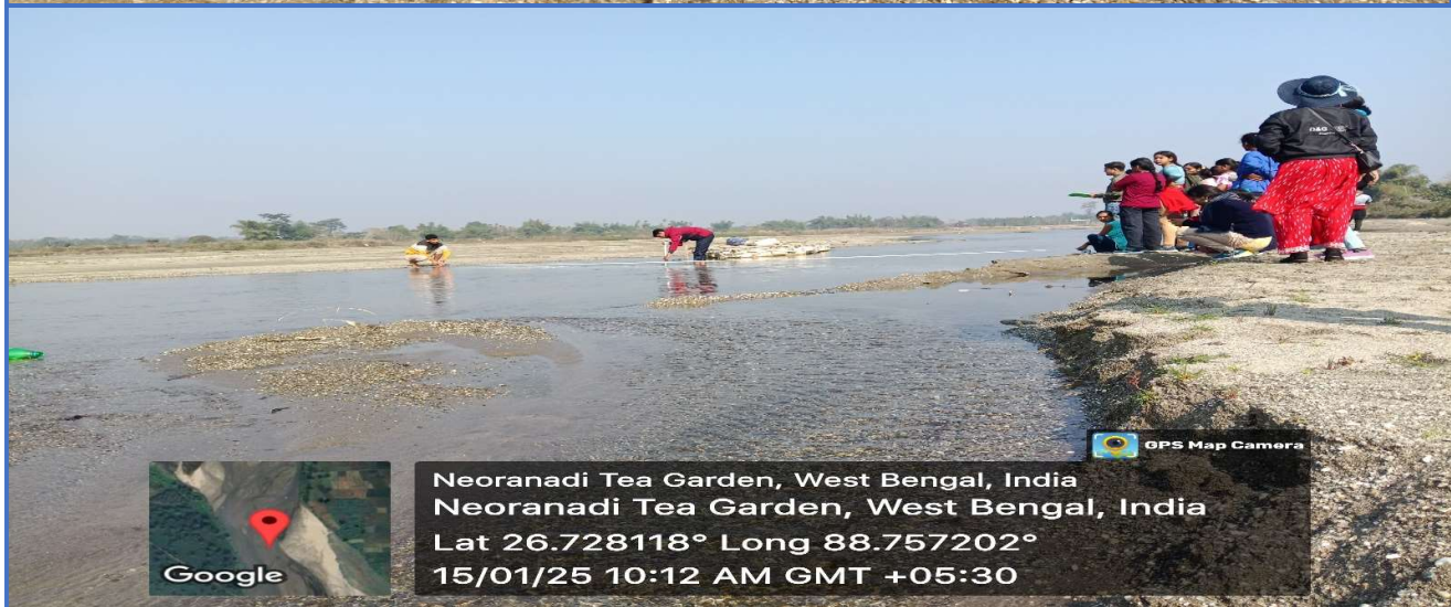
The Measurement of Stream Discharge at Neora River